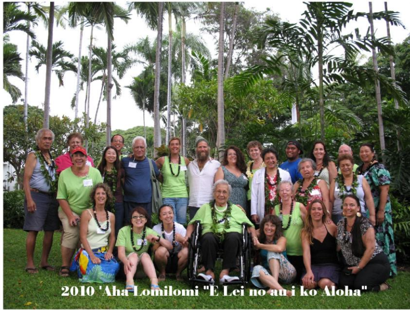
2010 'Aha Lomilomi "E Lei no au i ko Aloha"